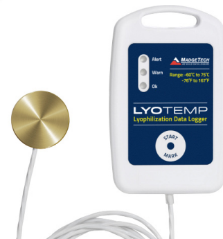
Compatible with the HiTemp140X2-FP data logger series, HiTemp140-FP data logger and the LyoTemp Data Logger.