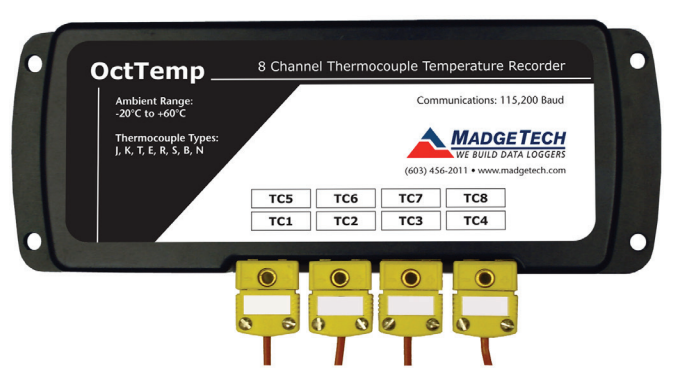
*Thermocouple Plugs/Probes Sold Separately

The OctTemp is an eight channel thermocouple data logger with a reading rate of up to 4 Hz. It can measure and record 500,000 readings per channel. To maximize memory capacity, users can enable or disable channels. For easy identification, each channel can be named with up to a ten digit title.