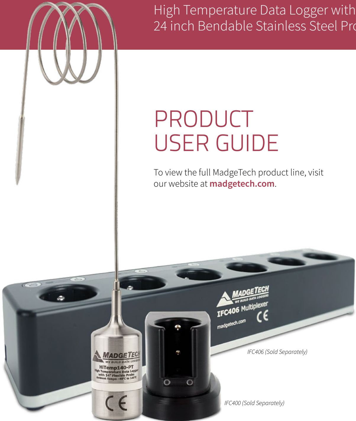
IFC406 (Sold Separately)

To view the full MadgeTech product line, visit our website at madgetech.com .