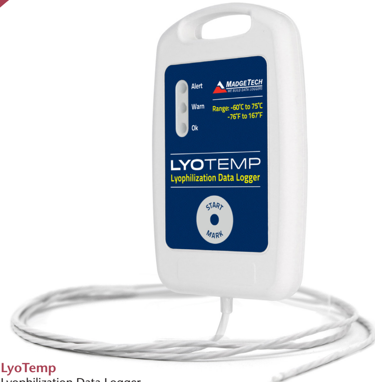
LyoTemp Lyophilization Data Logger

Specifications subject to change. See MadgeTech's terms and conditions at madgetech.com