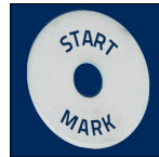
Close-up of the start/mark switch

To start the device, hold the magnetic wand over the start/mark switch. (Also indicated below)