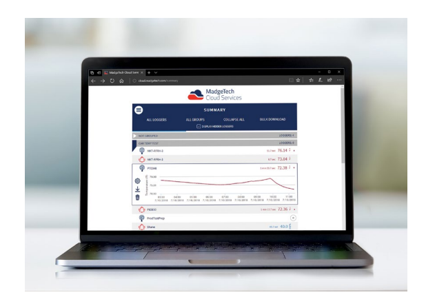
Email and Text Notifications