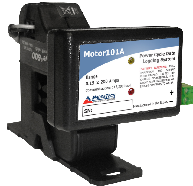
Motor101A Power Cycle Data Logging System

Specifications subject to change. See MadgeTech's terms and conditions at www.madgetech.com