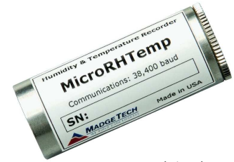
*Actual size shown

The MicroRHTemp is a battery powered, stand alone humidity and temperature recorder that can fit in the tightest places. It is even small enough to fit into most pill bottles. It features an LED alarm indicator that alerts when user-chosen temperature limits are exceeded. This all-in-one compact, portable, easy to use device will measure and record up to 16,383 measurements per channel. The storage medium is non-volatile solid state memory, providing maximum data security even if the battery becomes discharged. Start and stop the device directly from your computer and data retrieval is quick and easy. Simply plug it into an empty COM or USB port and our user-friendly software does the rest.