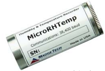
*Actual size shown

The MicroRHTemp is a battery powered, stand alone humidity and temperature recorder that can fit in the tightest places. It is even small enough to fit into most pill bottles. It features an LED alarm indicator that alerts when user-chosen temperature limits are exceeded. This all-in-one compact, portable, easy to use device will measure and record up to 16,383 measurements per channel. The storage medium is non-volatile solid state memory, providing maximum data security even if the battery becomes discharged. Start and stop the device directly from your computer and data retrieval is quick and easy. Simply plug it into an empty COM or USB port and our user-friendly software does the rest.