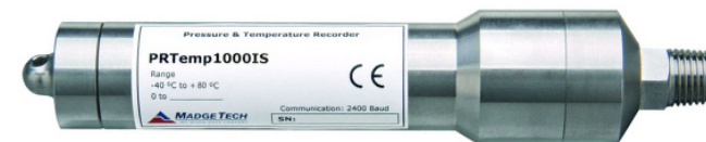
PRTemp1000IS Intrinsicly Safe Pressure and Temperature Recorder

PO Box 50 · Warner, NH 03278 Phone 603.456.2011 · Fax 603.456.2012 www.madgetech.com · info@madgetech.com