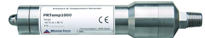
PRTemp1000 Rugged Pressure and Temperature Recorder