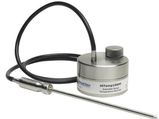
HiTemp150FP Extended Range Temperature Recorder with Flexible Probe