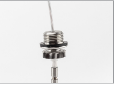
4. Hand twist the thumb screw into the probe receptacle until tight. Some threads will still be visible.