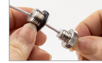
3. Insert data logger probe tip through the receptacle.